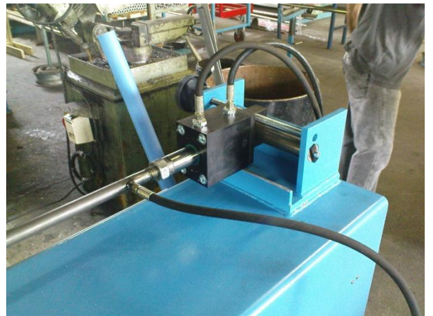
Fixation barre mandrin